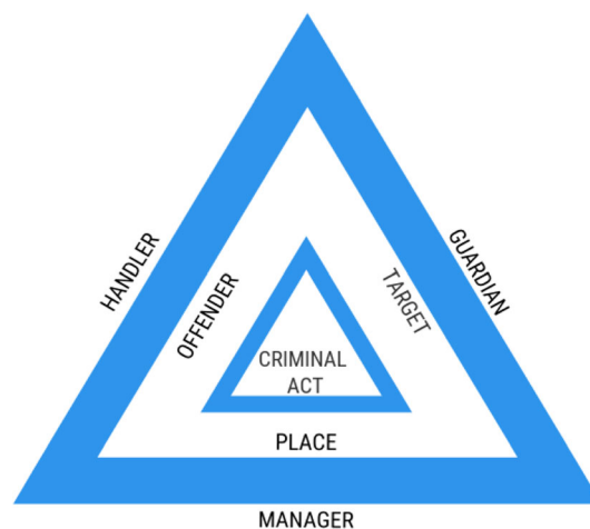
Fig. 1 The crime triangle (adapted from Eck 2003)