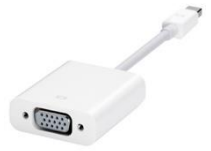
Apple HDMI/VGA connector

* Connecting a device via MAC requires using the HDMI/ VGA connector located in the front of the classroom, along with bringing your own Apple HDMI/VGA connector. *